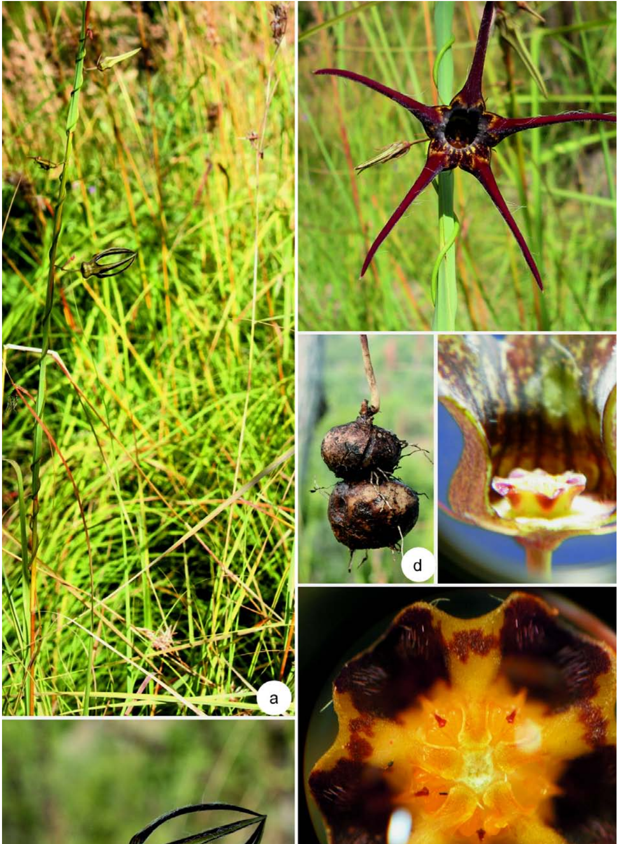
Fig. 2. Brachystelma volubile Hook. f.: a. Habitat; b. Flower at young stage; c. Flower at mature stage front view; d. Tubers; e. Flower L.S.; f. Corona.