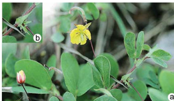
Fig. 1. Chamaecrista rotundifolia (Pers.) Greene: a. Flowering twig; b. Stipules magnified.