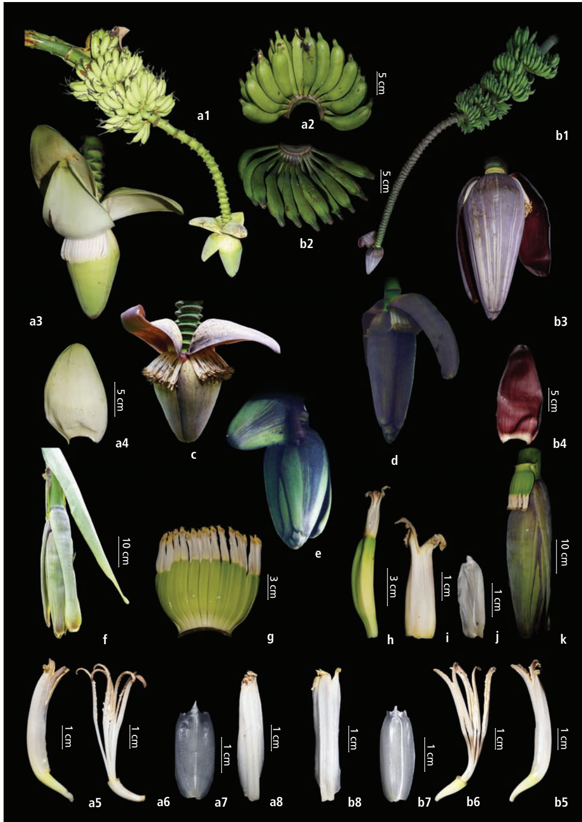
Fig. 3. Musa sabuana K. Prasad, A. Joe, Bheem. & B.R.P. Rao: a1–a8 (Little Andaman); b1–b8, c–k (Great Nicobar): a1, b1. Inflorescence; a2, b2. Fruit bunch; a3, b3, c,d. Intermediate forms of male bud; a4, b4. Male bract; f. Female inflorescence (early stage); g. Flower bunch; h–j. Female flower parts; h. Single flower; i. Compound tepal; j. Free tepal; k. Female bud; a5–a8, b5–b8. Male flower parts: a5, b5. Single flower; a6, b6. Rudiment pistillode with stamens; a7, b7. Free tepal; a8, b8. Compound tepal.