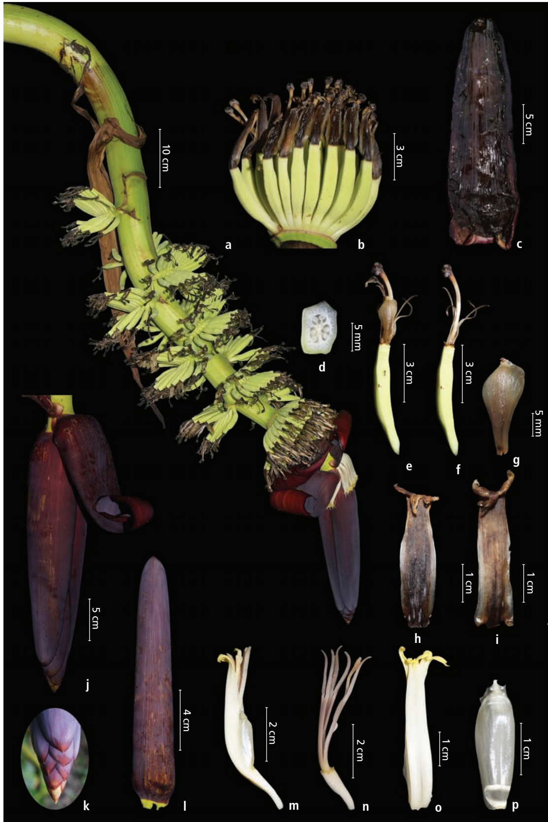
Fig. 2. Musa kattuvazhana K.C. Jacob: a. inflorescence; b–l. Female flower parts: b. Flower bunch; c. Bract; d. C.S. of ovary; e. Single flower; f. Flower without tepals; g. Free tepal; h, i. Compound tepal; j–p. Male flower and floral parts: j. Male Bud; k. Apex of bud enlarged; l. Bract; m. Single flower; n. Rudiment pistillode with stamens; o. Compound tepal; p. Free tepal.